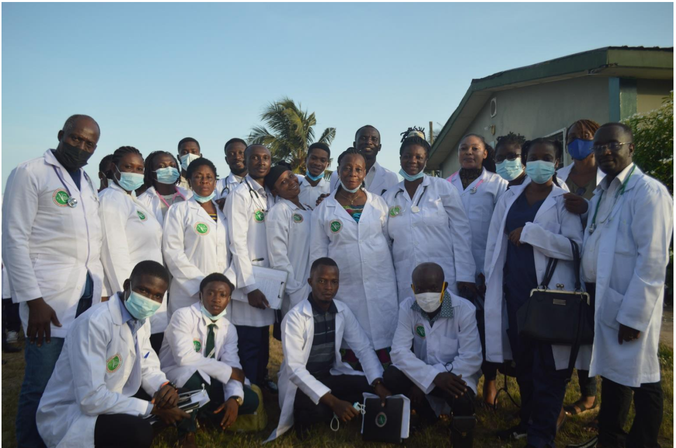
NDs students at NUCHMT