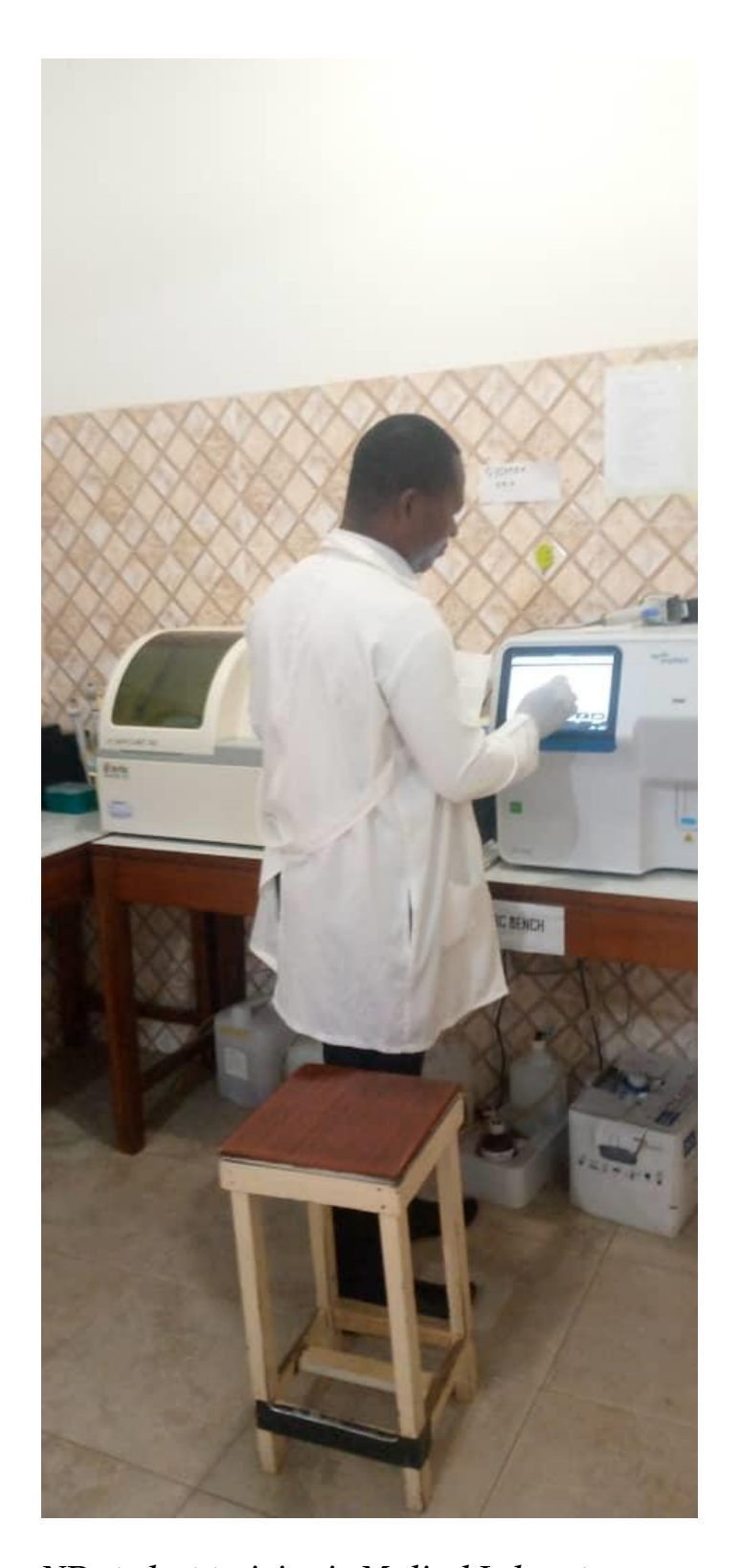
ND student training in Medical Laboratory