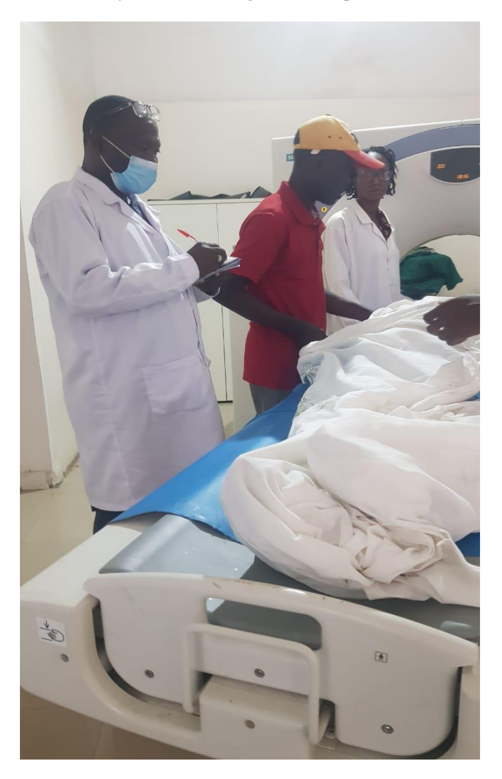
Shraz-ND candidate during his Medical Imaging clinical training at Tema General Hospital.