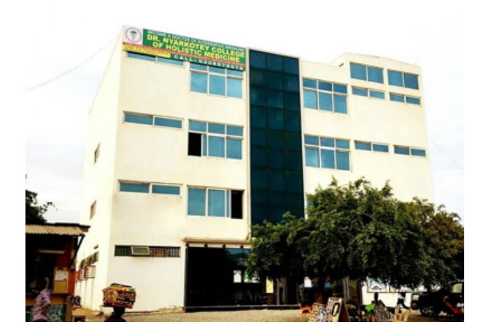
Fig. 2: Nyarkotey college of holistic medicine, ashaiman.

He took Naturopathy and holistic Medicine to a different level and established the first Naturopathic and Holistic Medical School, Nyarkotey College of Holistic Medicine, at Tema Community, 7, Post office and Ashaiman, behind the Municipal Assembly.<sup>25</sup>