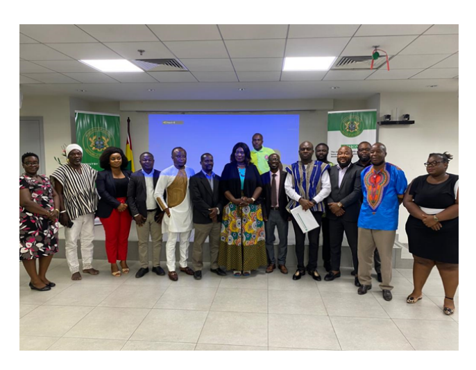
Fig. 5: Group photograph at the ministry of health traditional medicine practice council departmental heads and registrar after the occupational standards presentation

awarded by the Commission for Technical and Vocational Education and Training(CTVET) after students complete each unit of competencies that have been achieved. Before the development of the occupational standards, there was a social dialogue for the Complementary Medicine community in Ghana <sup>14</sup> to be abreast with the development.